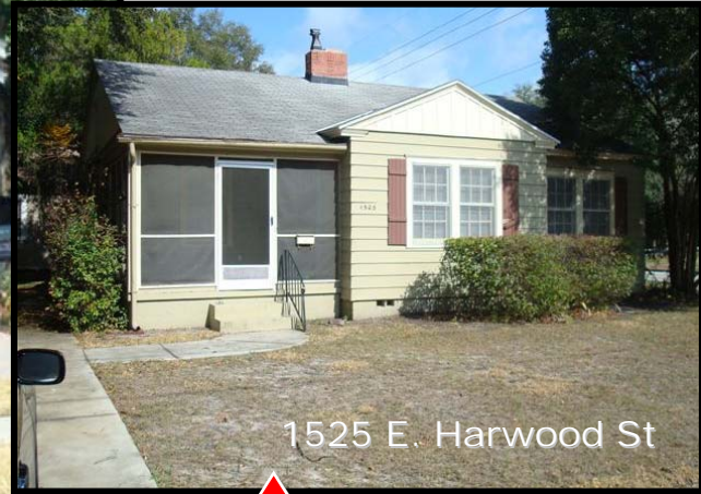
1525 E. Harwood St

TWO BUILDING COMMERCIAL/OFFICE AVAILABLE