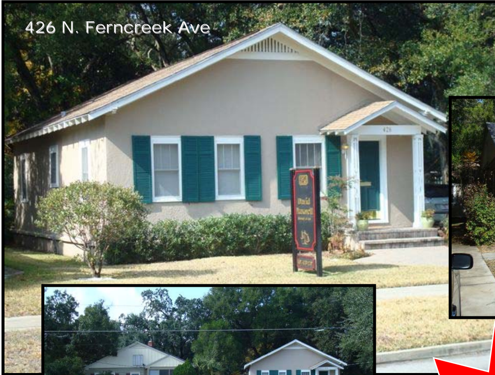
426 N. Ferncreek Ave

TWO BUILDING COMMERCIAL/OFFICE AVAILABLE