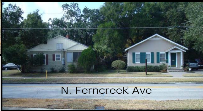
N. Ferncreek Ave