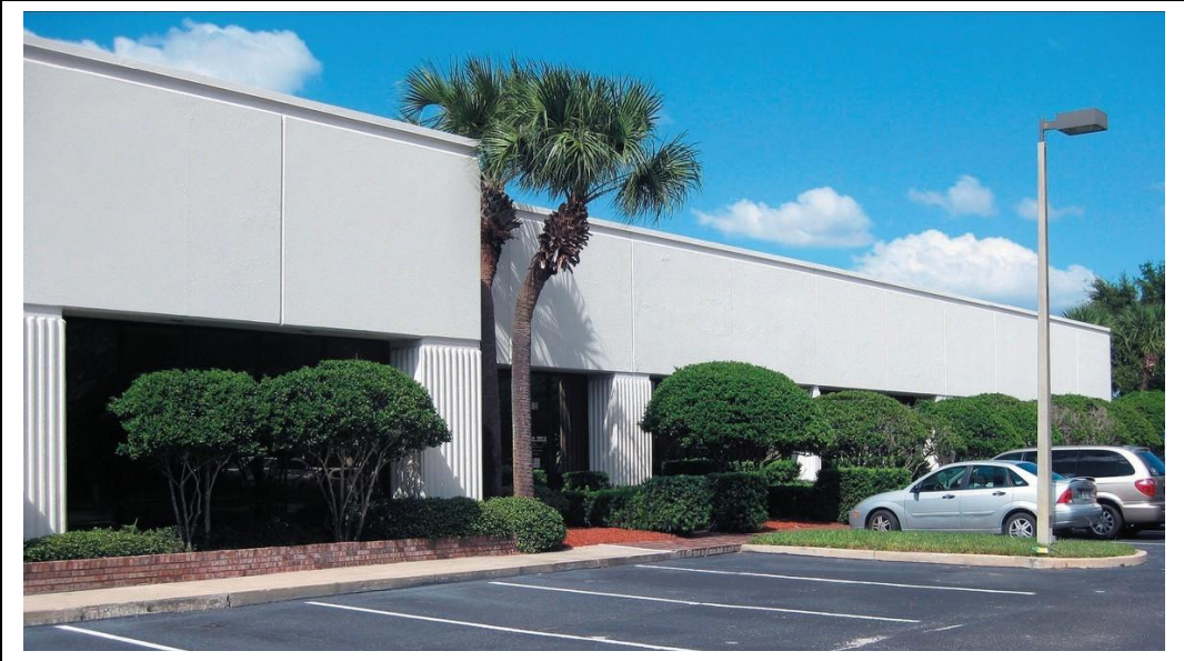
This information is from sources we deem reliable and is subject to prior sale, lease, withdrawal without notice, or change in prices, rates, or conditions. No representation is made as to the accuracy of any information furnished.