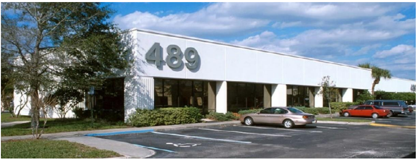
This information is from sources we deem reliable and is subject to prior sale, lease, withdrawal without notice, or change in prices, rates, or conditions. No representation is made as to the accuracy of any information furnished.