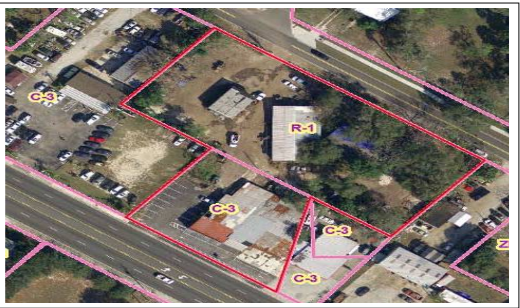
This information is from sources we deem reliable and is subject to prior sale, lease, withdrawal without notice, or change in prices, rates, or conditions. No representation is made as to the accuracy of any information furnished.