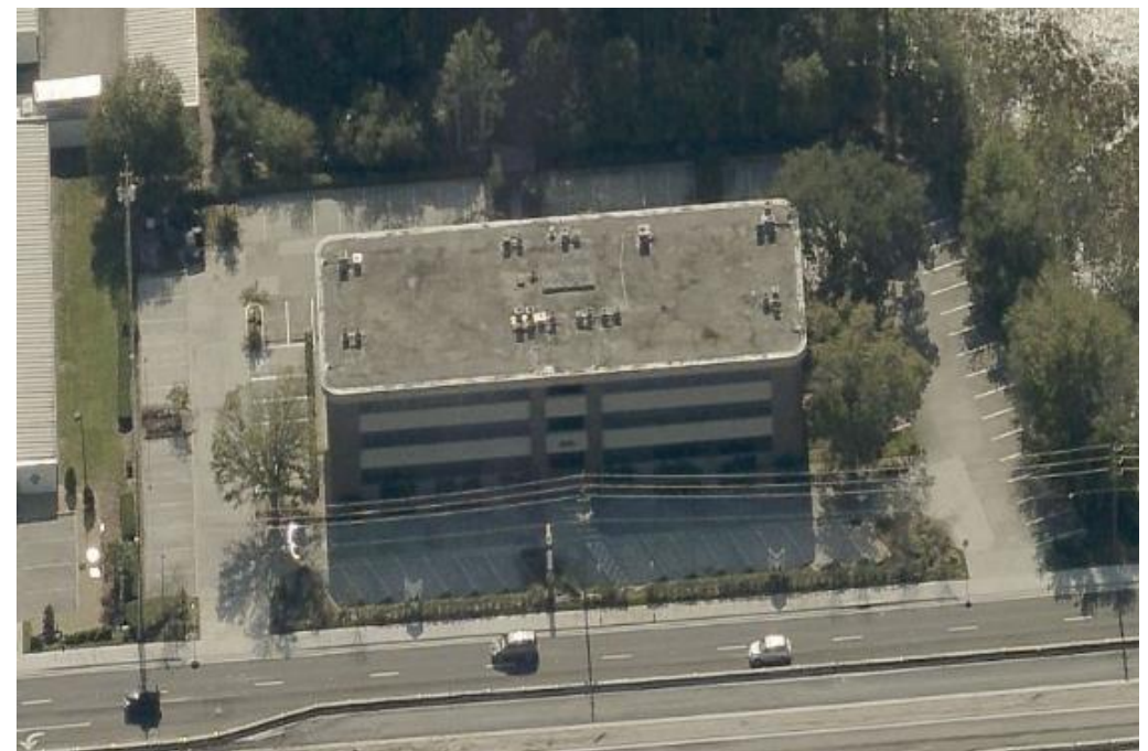
This information is from sources we deem reliable and is subject to prior sale, lease, withdrawal without notice, or change in prices, rates, or conditions. No representation is made as to the accuracy of any information furnished.