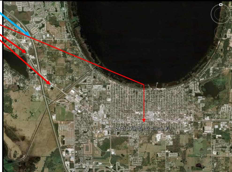
This information is from sources we deem reliable and is subject to prior sale, lease, withdrawal without notice, or change in prices, rates, or conditions. No representation is made as to the accuracy of any information furnished.