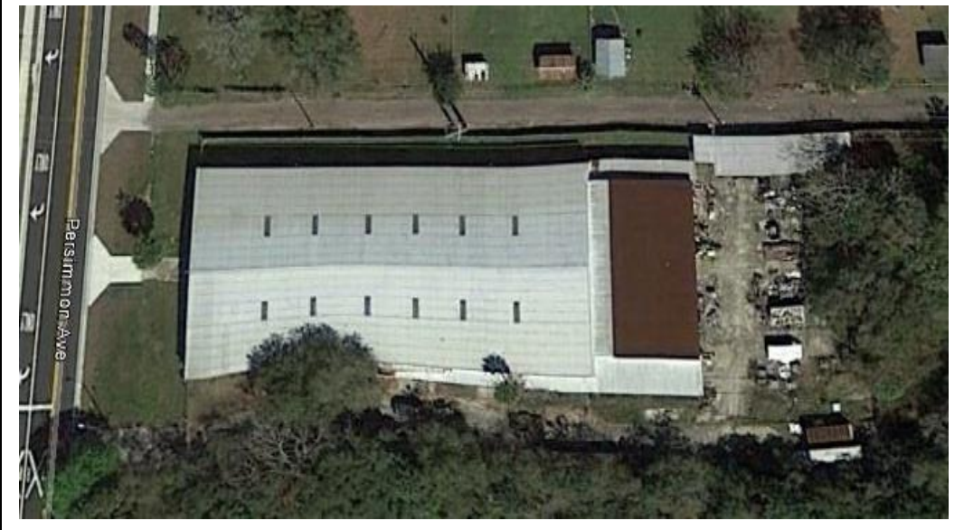
This information is from sources we deem reliable and is subject to prior sale, lease, withdrawal without notice, or change in prices, rates, or conditions. No representation is made as to the accuracy of any information furnished.