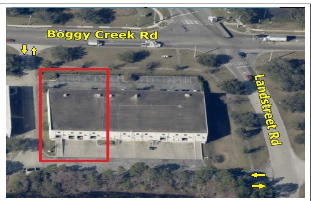
This information is from sources we deem reliable and is subject to prior sale, lease, withdrawal without notice, or change in prices, rates, or conditions. No representation is made as to the accuracy of any information furnished.