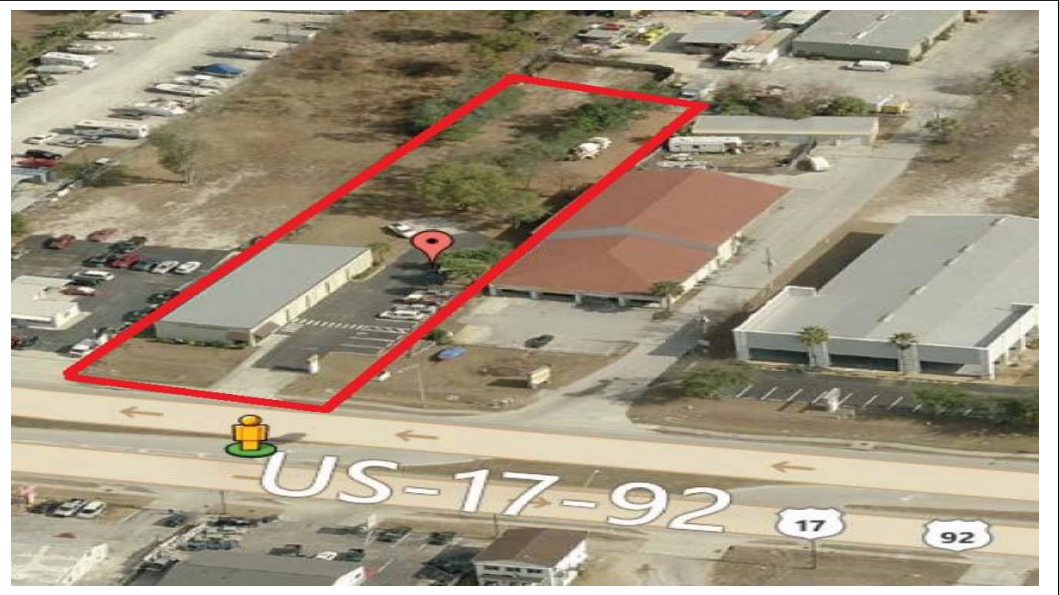
This information is from sources we deem reliable and is subject to prior sale, lease, withdrawal without notice, or change in prices, rates, or conditions. No representation is made as to the accuracy of any information furnished.