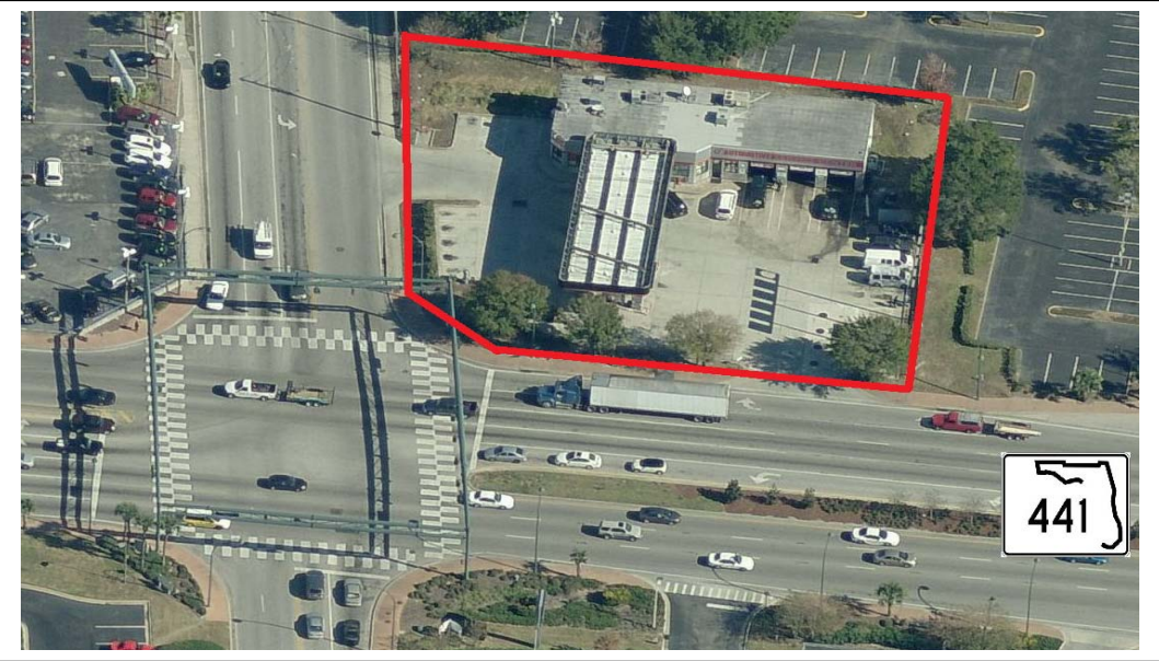
This information is from sources we deem reliable and is subject to prior sale, lease, withdrawal without notice, or change in prices, rates, or conditions. No representation is made as to the accuracy of any information furnished.