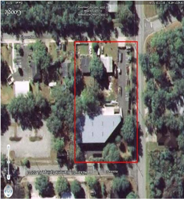
BAYWOOD STREET (50' R/W)